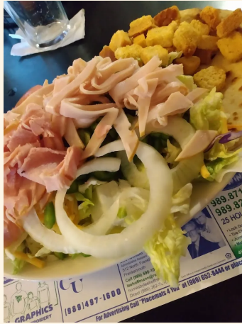
Chili and Salad Combo